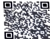
Vice-Chancellor/Registrar Gujarat University